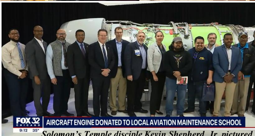
Chicago aviation students receive engine donation from American Airlines Aviation students are getting a jet-fueled boost for the future courtesy of American Airlines.

“When you change the way you look at things, the things you look at change.” Max Planck “Confidence on the outside begins by living with integrity on the inside.” Brian Tracy “If you don’t go after what you want, you’ll never have it. If you don’t ask, the answer is always no. If you don’t step forward, you’re always in the same place.” Nora Roberts “The most important thing in life is to stop saying ‘I wish’ and start saying ‘I will.’ Consider nothing impossible, then treat possibilities as probabilities.” David Copperfield