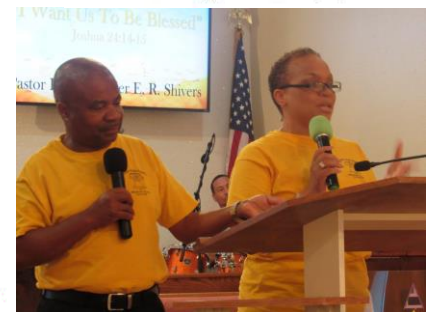
Pastor & Co-Pastor Shivers Tag-Team Preaching

Disciples are asked to wear an orange, red, blue, or black t-shirt with blue jeans and sneakers.