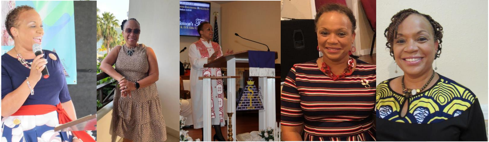
Prayer Points for Pastors' Wives faithvictorious.com

Pray and ask the Lord to also fill her with insights and revelation of Scripture so she may know and see her true worth and self in Christ, in Jesus name. The eyes of your understanding being enlightened; that ye may know what is the hope of his calling, and what the riches of the glory of his inheritance in the saints, (Ephesians 1:18, KJV).