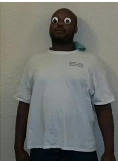
Guess Who??? He did not want to make an emoji pillow; he decided be an emoji!!!