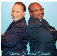
Shivers Funeral Chapel