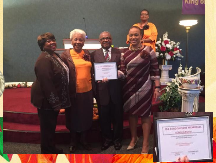
The Lees at Work together!