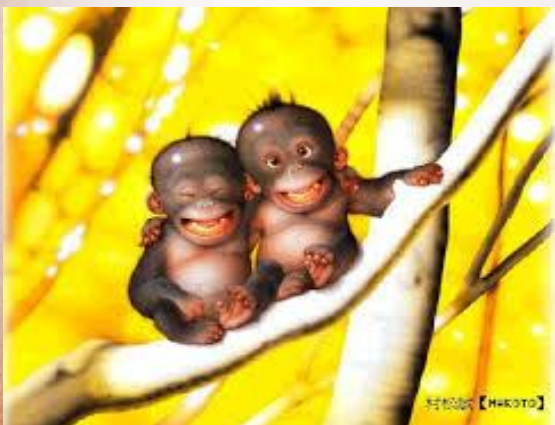
Everyone needs a smile!